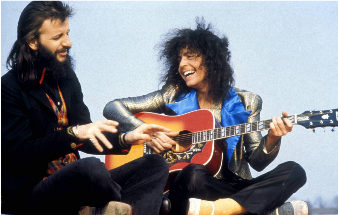
Ringo Starr and T-Rex's Marc Bolan filming 1972 film 'Born To Boogie'.

At last night's (November 7) Rock and Roll Hall of Fame ceremony, late T-Rex frontman Marc Bolan was among the new inductees, and he was welcomed into the Hall by Beatles drummer Ringo Starr .